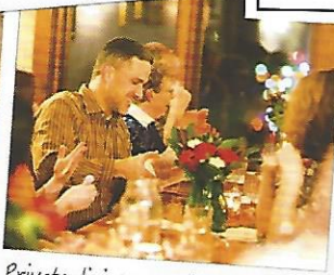
Private dining room for parties of 10 or more