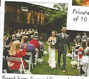
Event barn for weddings and private events