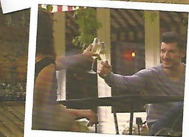
Join us just for drinks and appetizers in our Wine Lounge or outdoors

5 Greenhouse Road, Bradford, NH 03221 www.bradfordvillageinn.com 603.938.6336