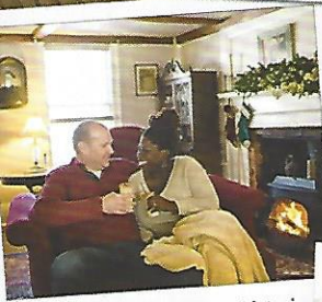
Fourteen guestrooms on a historic farm dating back to 1797