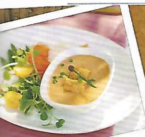
Chef's Menu - updated weekly for dining Wednesday through Sunday nights

By reservation www.colbyhillinn.com 603-428-3281